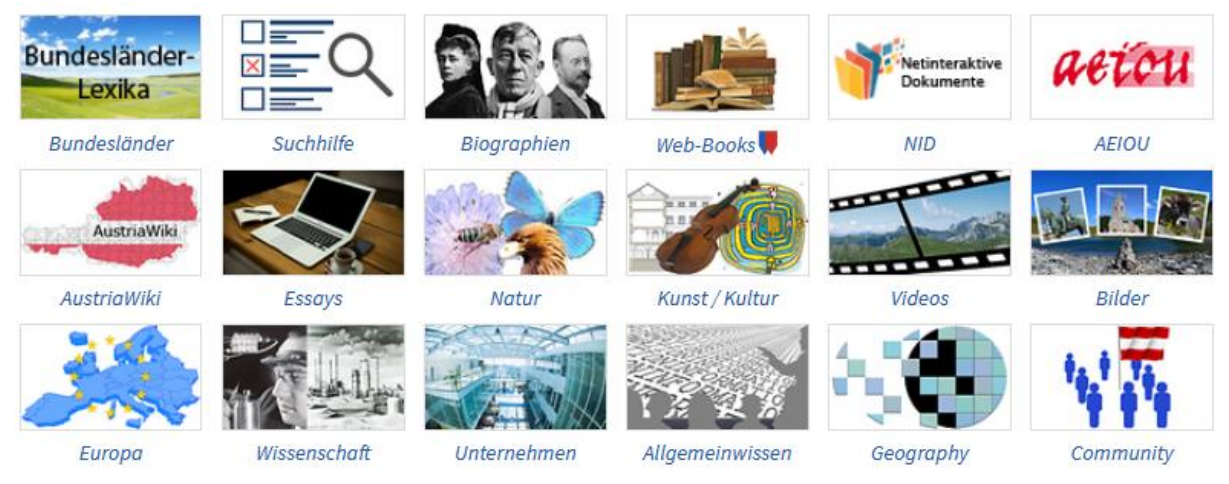
Fig.1: Part of the Entry page of Austria-Forum

Please select austria-forum.org with your browser. Fig.1 shows part of the resulting page.