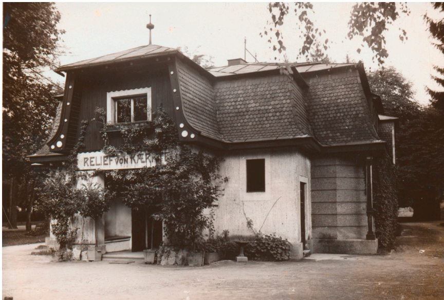
Figure 3. Shelter building for the Landscape Relief Model of Carinthia with changed roof membrane made of tin (around 1925).

a scientific work of art (cf. [9]), even if we are not taking into account the magnificent value-adding by means of most advanced IT technology (see next chapter).