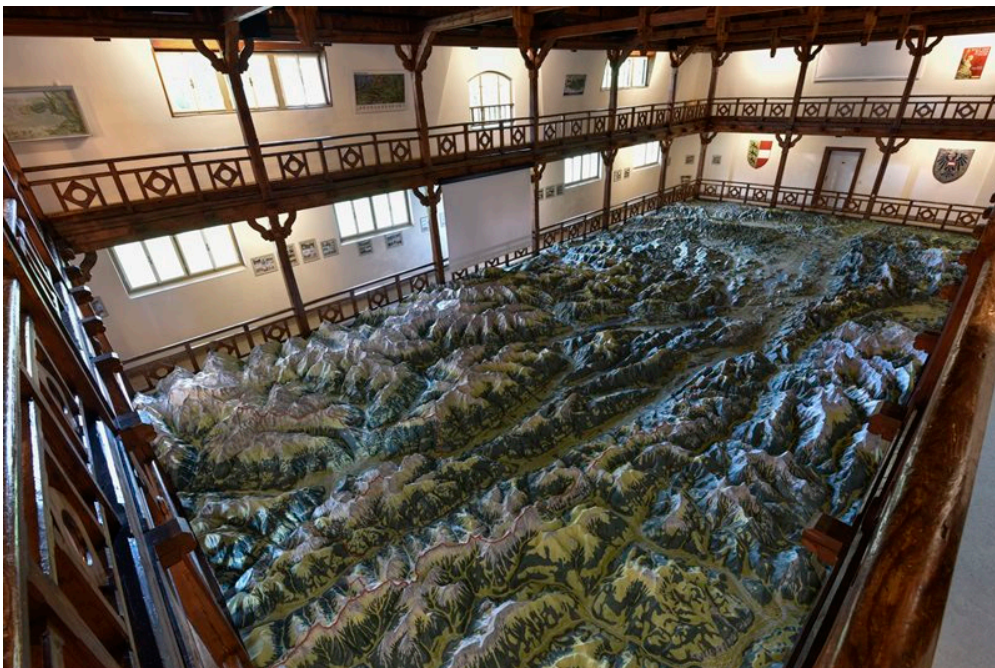
Figure 4. Present-day impression of Relief von Kärnten without IT augmentation. In the upper center, the vertical screen for video projection can be seen. From the Internet Presentation of the Municipal Museum and Archive of the City of Villach.