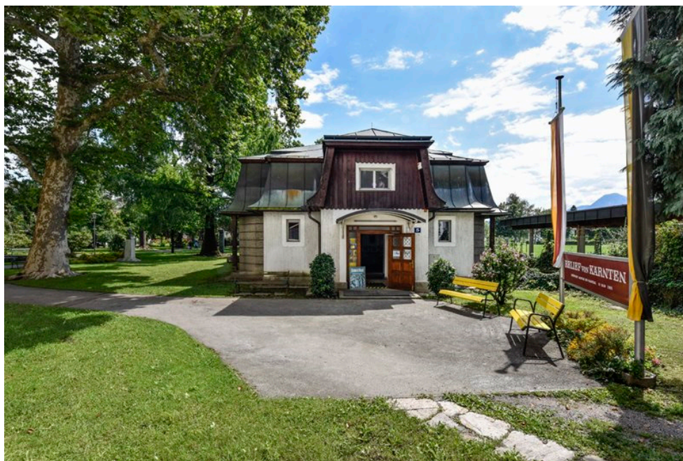
Figure 5. Present-day view of the Relief von Kärnten Pavillon at the Schillerpark in Villach. From the Internet Presentation of the Municipal Museum and Archive of the City of Villach.

“augmenting” the relief model with some of his landscape pictures. Although this was, for protective reasons, not possible, the idea was born to “value-enhance” the landscape relief model by adding complementary geo-information. So, for some years, the Municipal Museum of Villach began to investigate technical possibilities for materializing an improved modern form of museal communication that allows an up-to-date and innovative presentation and, at the same time, acknowledges the statutory provisions of legal monumental protection (Figure 5).