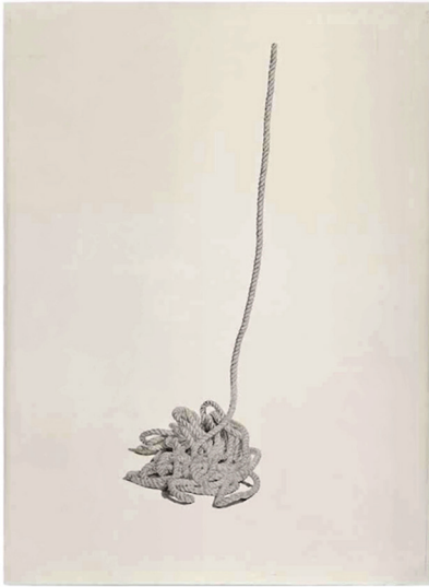
Fig.: Untitled (Rope 2) , 2011 Oil on canvas, 94.3 x 59.4 cm

synthetic wax, and place the viewer in a timeless and enigmatic space of both mediation and uncertainty.