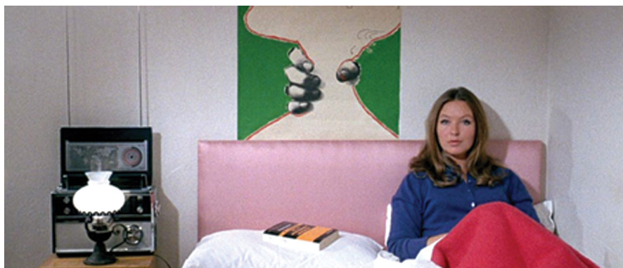
Fig. 5: 2 OU 3 CHOSES QUE JE SAIS D'ELLE (Jean-Luc Godard, FR/IT 1967). The movie marks a turning point in Godard's career, for it is his first cinematic essay in which images are accompanied by the narration using his own voice and in which characters are repeatedly directed to break the fourth wall by gazing directly at the camera and introduce themselves to the viewer.