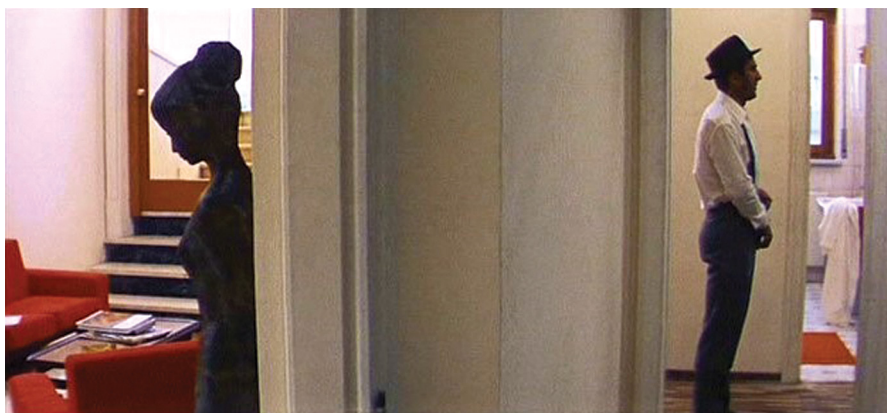
Fig. 9. LE MÉPRIS (Jean-Luc Godard, FR/IT 1963): The perplexed artist, the image of a muse, and the wall between them. Characters looking away, distancing themselves mentally and emotionally from one another, is a perpetual motif in Godard's film. Is it a sign of contempt, i.e. le mépris , for the society that, as Godard must have deemed, is necessary to elicit the qualities of enlightened being? Does it stem from the belief that one must reject society if one is to find one's true self and deliver the highest potential of one's being to the world?