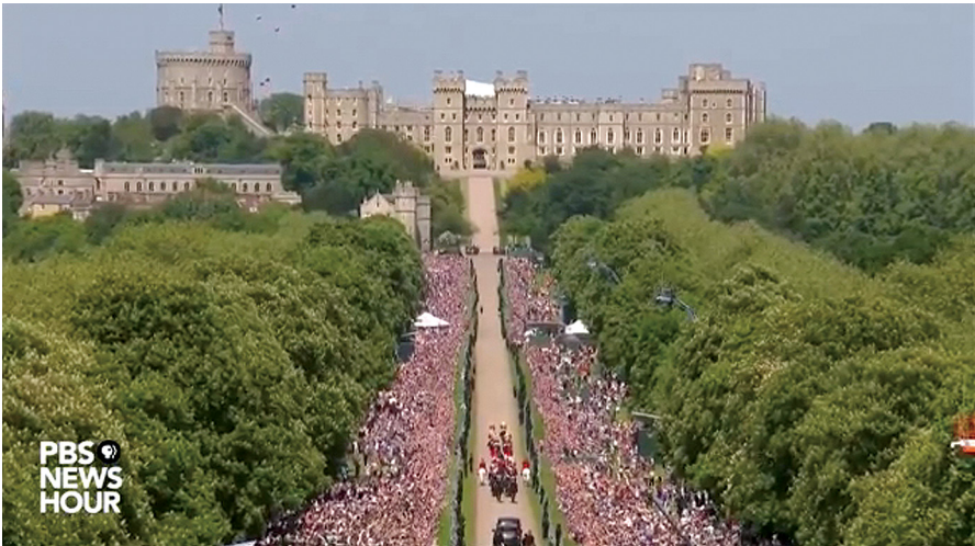
Fig. 1: Longshot from the air shows spectators lining the streets to celebrate the just-married couple (PBS, News Hour, 21 May 2018, 01:34:21). 1

On 19 May 2018 the royal wedding of Prince Harry and Meghan Markle flooded the television channels. Millions of spectators around the globe watched the event on screens and more than 100,000 people lined the streets of Windsor, England, to see the newly wed couple (fig.1). 2