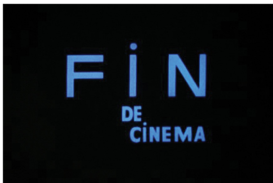
Fig. 12: WEEK-END (Jean-Luc Godard, FR/IT 1967). The epic final screenshot drawing the curtain on cinema in Godard's eyes and on the entire La Nouvelle Vague era. The carpet bomb was detonated, everything that made cinema what it was lay deconstructed and demolished, and the end of cinema as we had known it could be announced. Would all other social spheres be revitalized, fostered to evolve at an unprecedented rate or simply

be sentenced to permanent desertion and infertility had everybody's aim been to create something similar to what Godard strived to create under this "the end of cinema" banner, that is, to shatter the paradigm, to get rid of the old, to erase the standards and, effectively, abolish the need for the given sphere to exist under the Sun?