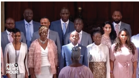
Fig. 9: Kingdom Gospel Choir performs at the wedding of Meghan Markle and Prince Harry (PBS, News Hour, 21 May 2018, 00:38:50). 11

Austria (and, we would argue, also in the rest of Europe) are designed by paid wedding planners as idealistic and individualistic rituals, the sequence that is followed in the preparation and the ritual itself is highly standardized, although open to individual adaptations. 12