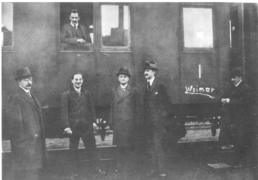
FIGURE 4 State Secretary Otto Bauer along with companions at the Westbahnhof train station just before his departure to Weimar, 23 February 1919