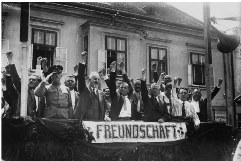
FIGURE 13 Protection League (Schutzbund) march in Eisenstadt, 1932; Otto Bauer standing in the middle on the bleachers

PHOTOGRAPHER: ALBERT HILSCHER. ÖSTERREICHISCHE NATIONALBIBLIOTHEK, INVENTORY NUMBER: NB H 1308/4