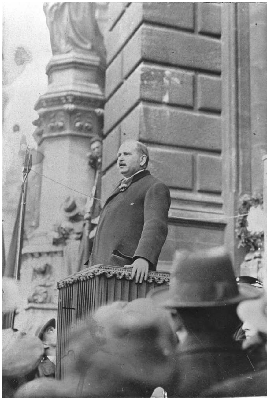
FIGURE 11 Otto Bauer in front of Vienna's City Hall around 1930 ÖSTERREICHISCHE NATIONALBIBLIOTHEK, INVENTORY NUMBER: NB 535298-B.