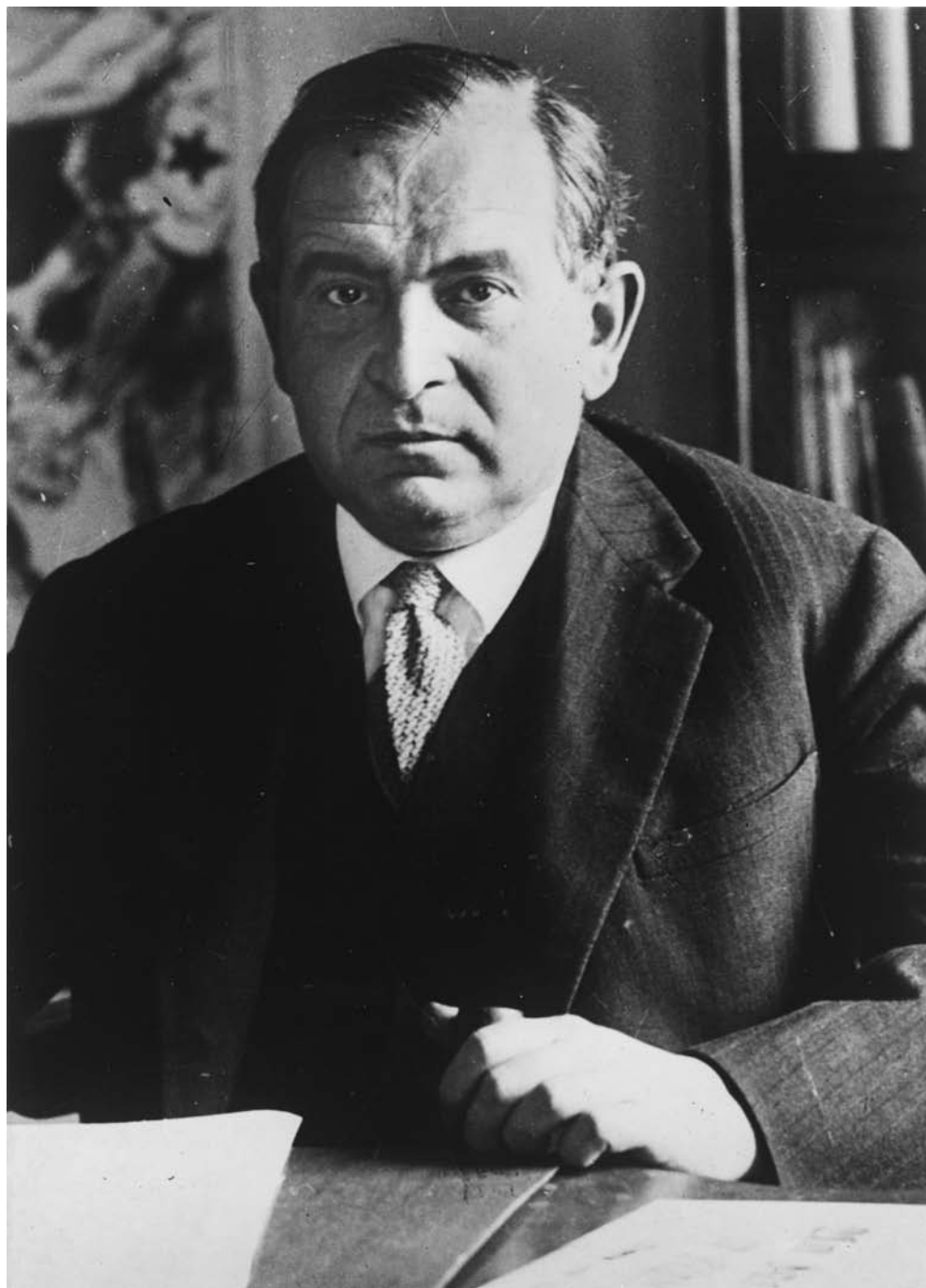
Otto Bauer in 1931