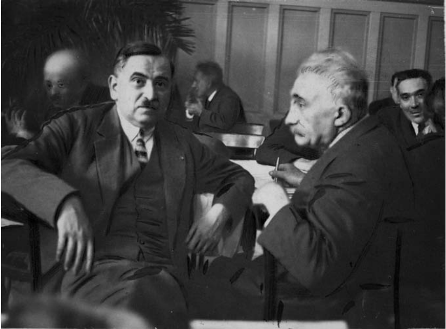
FIGURE 7 Otto Bauer (left) with Alexandre Marie Bracke-Desrousseaux during the Social Democratic Party Congress in Vienna, October 1929 ÖSTERREICHISCHE NATIONALBIBLIOTHEK, INVENTORY NUMBER: E2/6