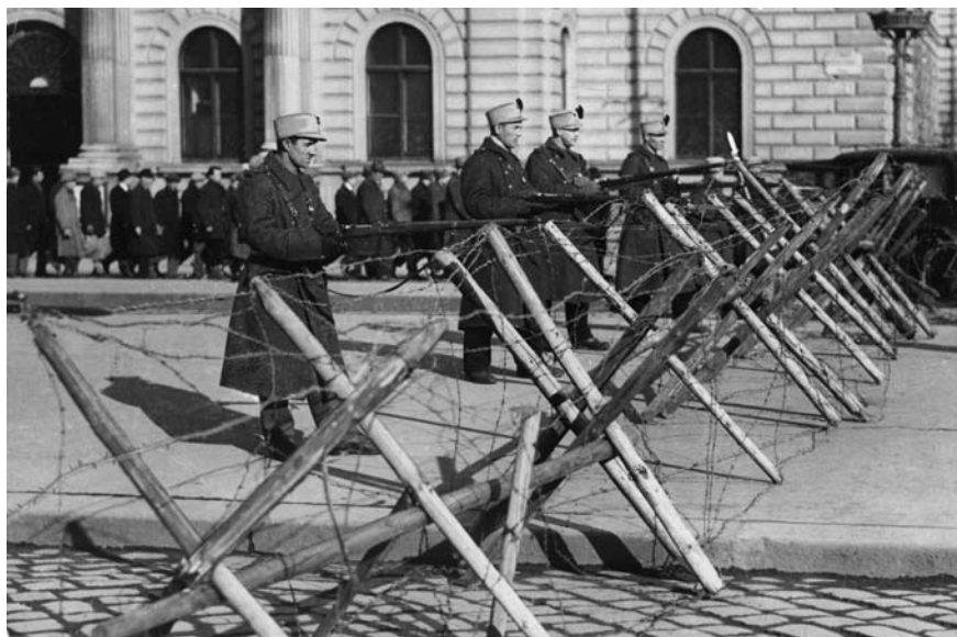
FIGURE 15 Homeguard (Heimwehr) positioned in front of the Burgtheater, 12 February 1934 PHOTOGRAPHER: FRANZ BLAHA. ÖSTERREICHISCHE NATIONALBIBLIOTHEK, INVENTORY NUMBER: E2/6