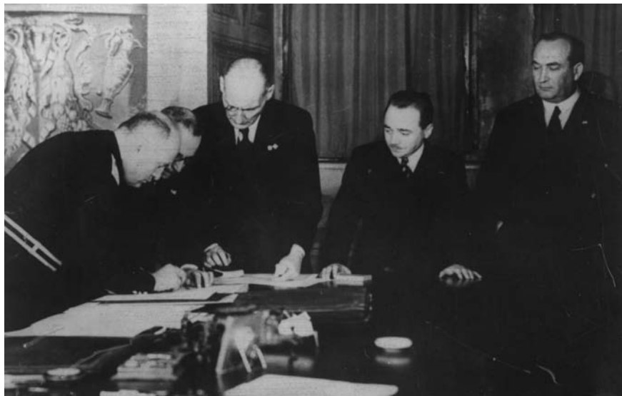
FIGURE 18 Dollfuss with Gombos and Mussolini, signing the Rome Protocols on 17 March 1934 ÖSTERREICHISCHE NATIONALBIBLIOTHEK, INVENTORY NUMBER: PF 5465 c(36)