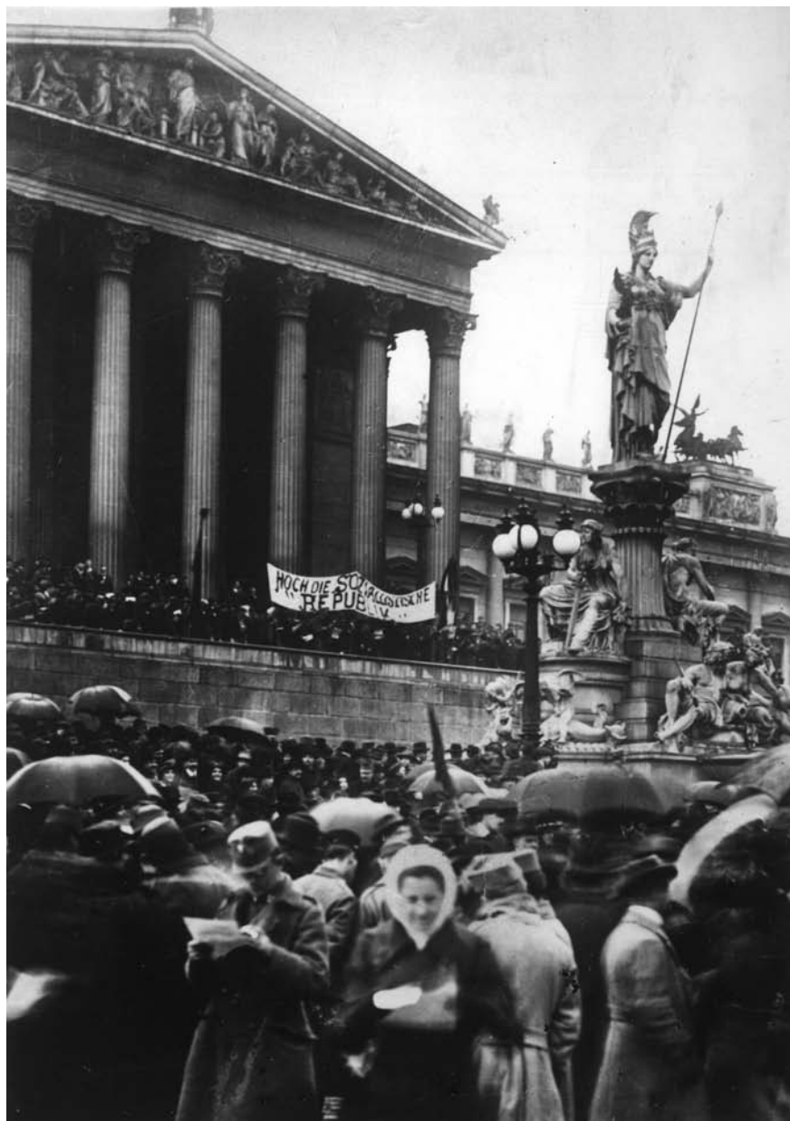
FIGURE 3 Mass demonstration in front of Parliament on the occasion of the proclamation of the First Republic of German Austria, 12 November 1918 ÖSTERREICHISCHE NATIONALBIBLIOTHEK, INVENTORY NUMBER: E10/295