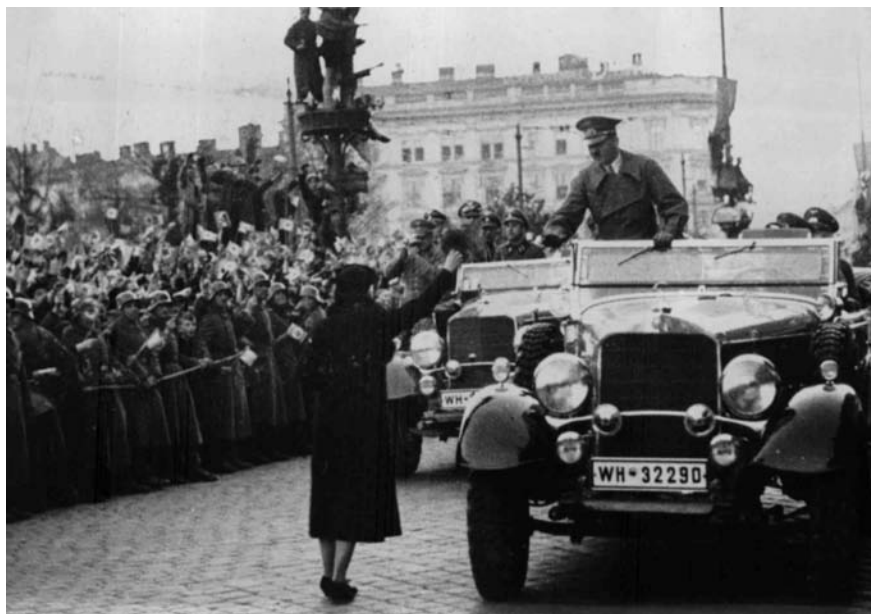
FIGURE 19 Warm welcome for Hitler in Vienna, 1938 ÖSTERREICHISCHE NATIONALBIBLIOTHEK, INVENTORY NUMBER: S 60/41