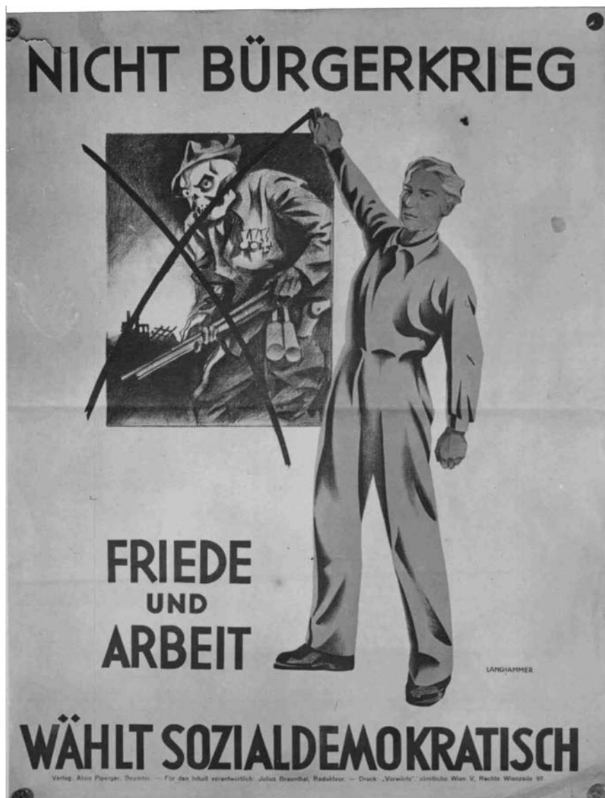
FIGURE 12 SDAP poster for the National Council elections on 9 November 1930 (text: “Not civil war / peace / and / work / vote social democratic”)