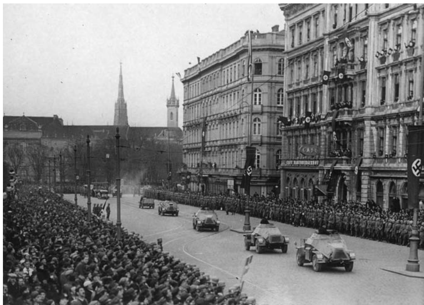
FIGURE 21 Hitler in Vienna, 15 March 1938.