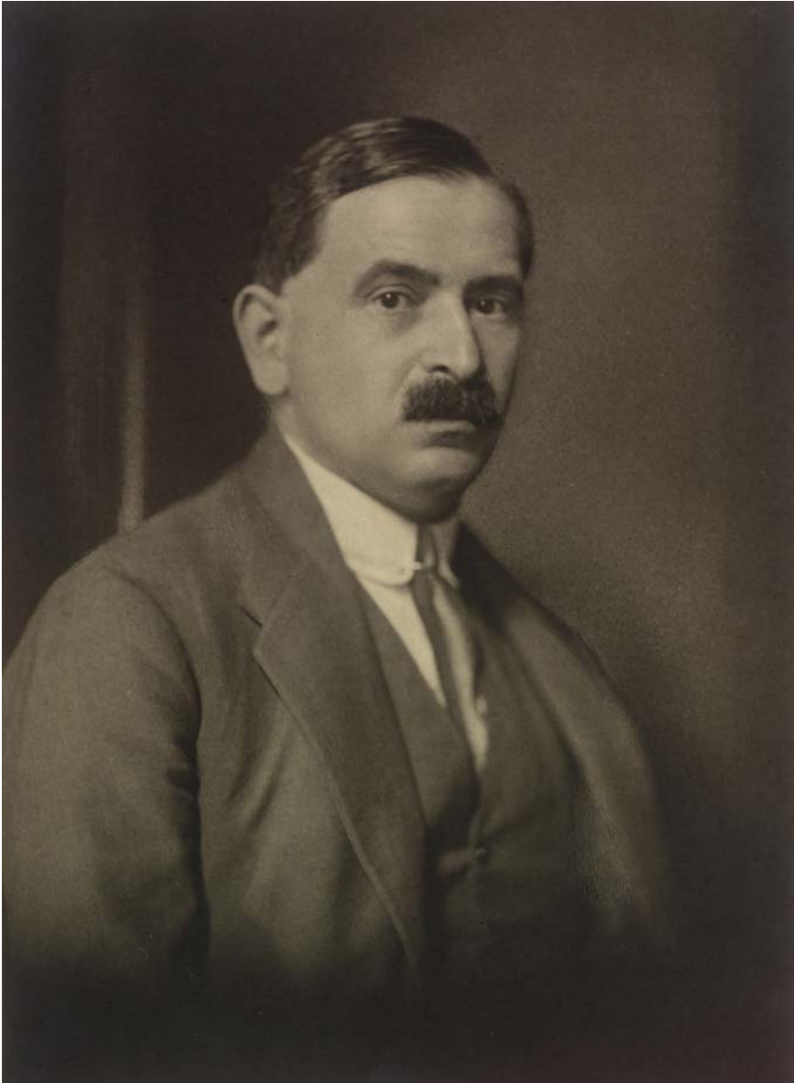
FIGURE 1 Otto Bauer around 1920

PHOTOGRAPHER: ALBERT HILSCHER OTTO BAUER. ÖSTERREICHISCHE NATIONALBIBLIOTHEK, INVENTORY NUMBER: PF 737 E1 OR H 680/1