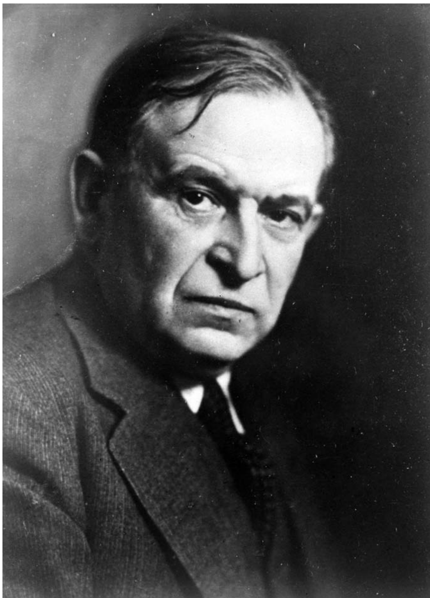
FIGURE 2 Otto Bauer