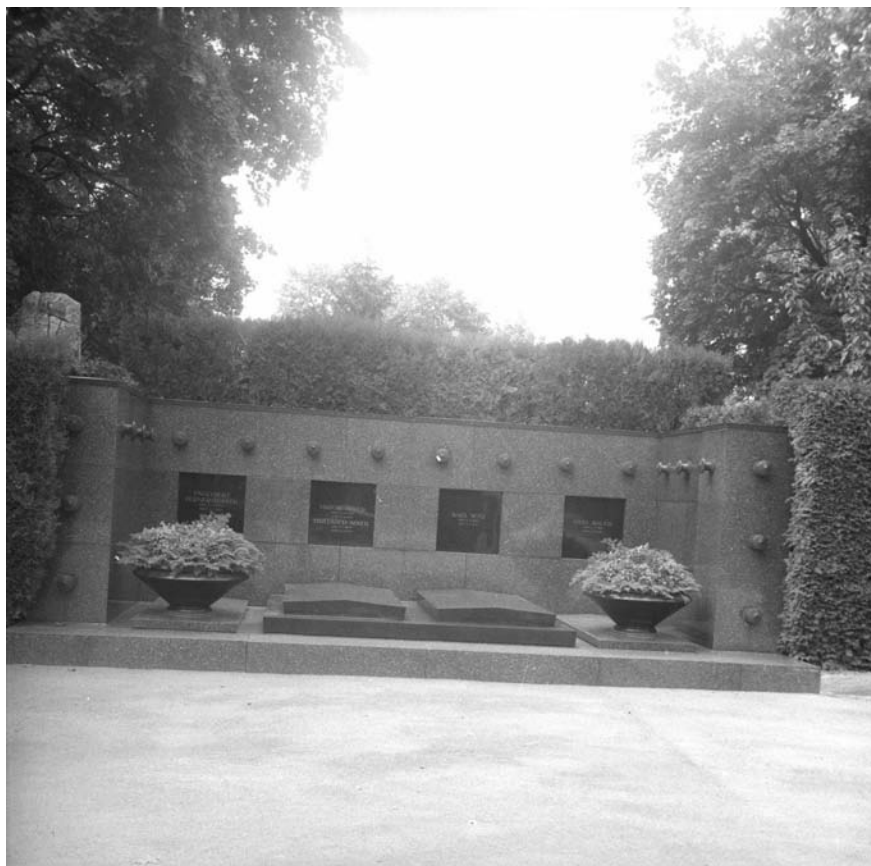
FIGURE 23 Graves of Friedrich Adler, Engelbert Pernerstorfer, Viktor Adler, Karl Seitz and Otto Bauer in the Zentralfriedhof of Vienna