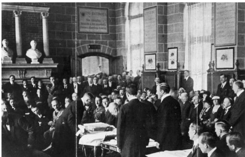
FIGURE 5 Austrian Chancellor Karl Renner signs the Treaty of St. Germain at the castle of St. Germain in 1919 ÖSTERREICHISCHE NATIONALBIBLIOTHEK, INVENTORY NUMBER: S 646/69