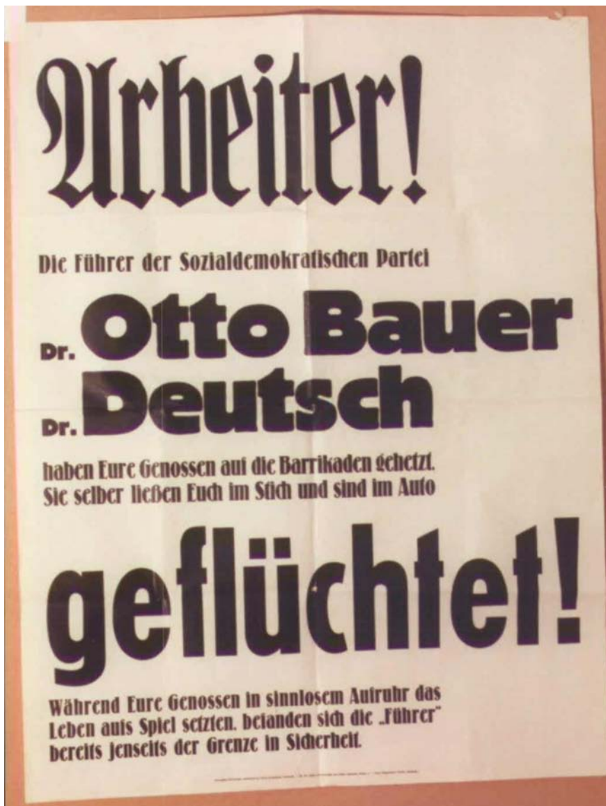
FIGURE 17 Flyer announcing Otto Bauer and Julius Deutsch's escape in 1934. (Text: "Workers! The leaders of the Social Democratic Party: Dr. Otto Bauer – Dr. Deutsch – drove your comrades to the barricades. They let you down and fled by car! While your comrades put their lives at risk in senseless revolt, the "leaders" were already safe at the other side of the border.")

ÖSTERREICHISCHE NATIONALBIBLIOTHEK, INVENTORY NUMBER: PLA16318199