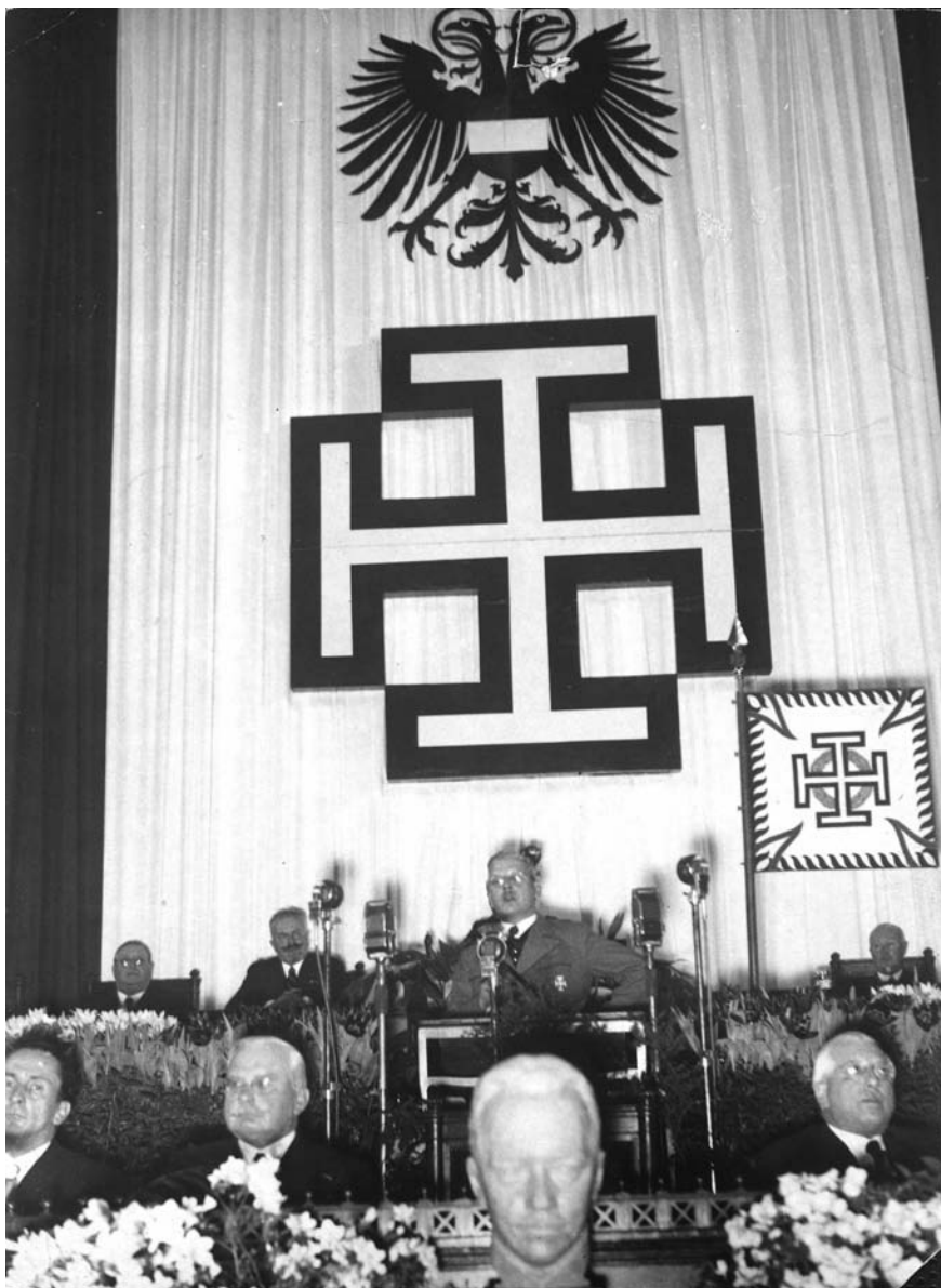
FIGURE 20 Speech of Kurt von Schuschnigg to the Bundestag, 24 February 1938.