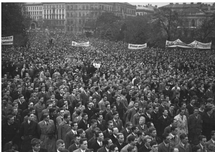
FIGURE 14 National Socialist rally in front of the Karlskirche in Vienna on 12 November 1932

PHOTOGRAPHER: ALBERT HILSCHER. ÖSTERREICHISCHE NATIONALBIBLIOTHEK, INVENTORY NUMBER: NB H 1308/4