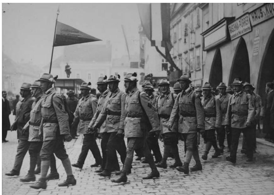
FIGURE 16 Marching Home Guard unit. Photographer: Lothar Rübelt. ÖSTERREICHISCHE NATIONALBIBLIOTHEK, INVENTORY NUMBER: RÜ Z 1282