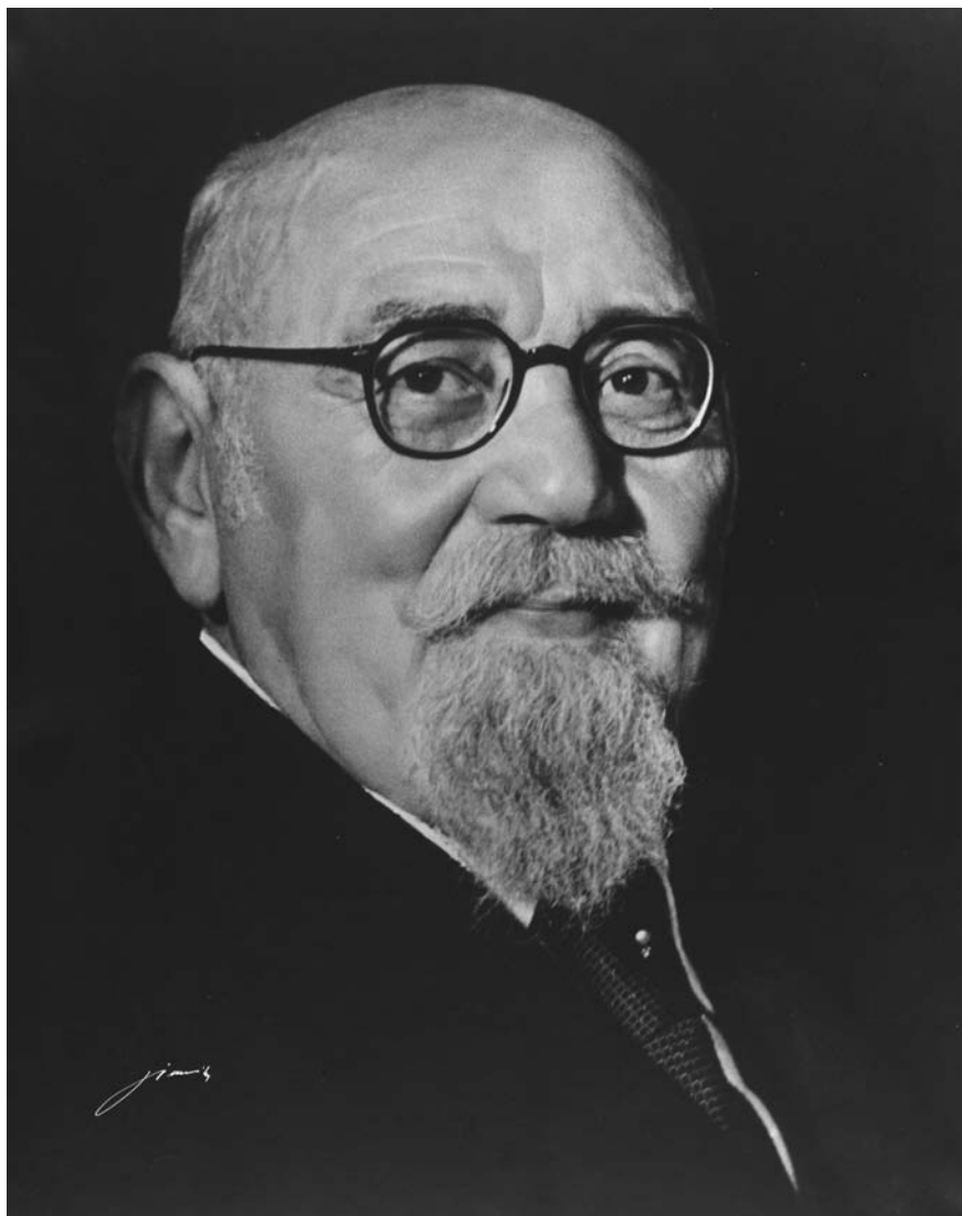
FIGURE 6 Karl Renner, First President of the 2nd Republic, around 1949 ÖSTERREICHISCHE NATIONALBIBLIOTHEK, INVENTORY NUMBER: SIM 21